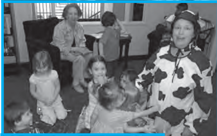
Temple Tots students, teachers, and volunteers love our Engel Library!