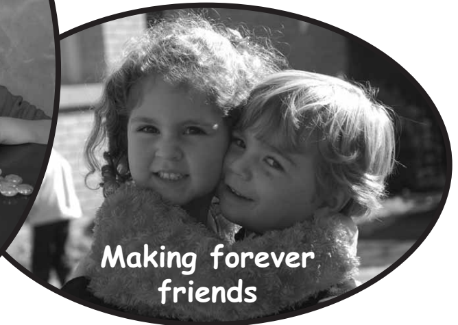
Making forever friends