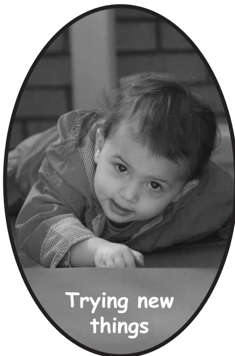
Trying new things