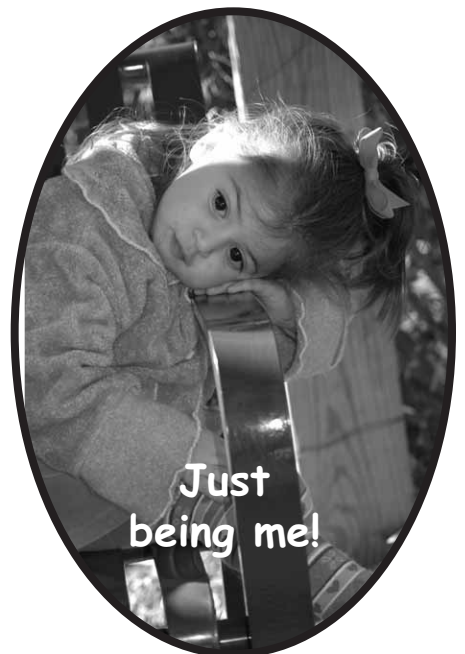
Just being me!